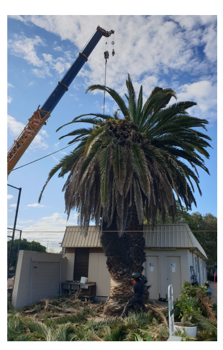
ABOVE: A CRANE SUPPORTING THE REMOVAL OF THE LARGE PALM TREES NEXT TO THE BOWLERS SHED

The removal of the old palm trees gave us the space to create a great new undercover barbecue area next to the bowlers shed. This new area is a fantastic